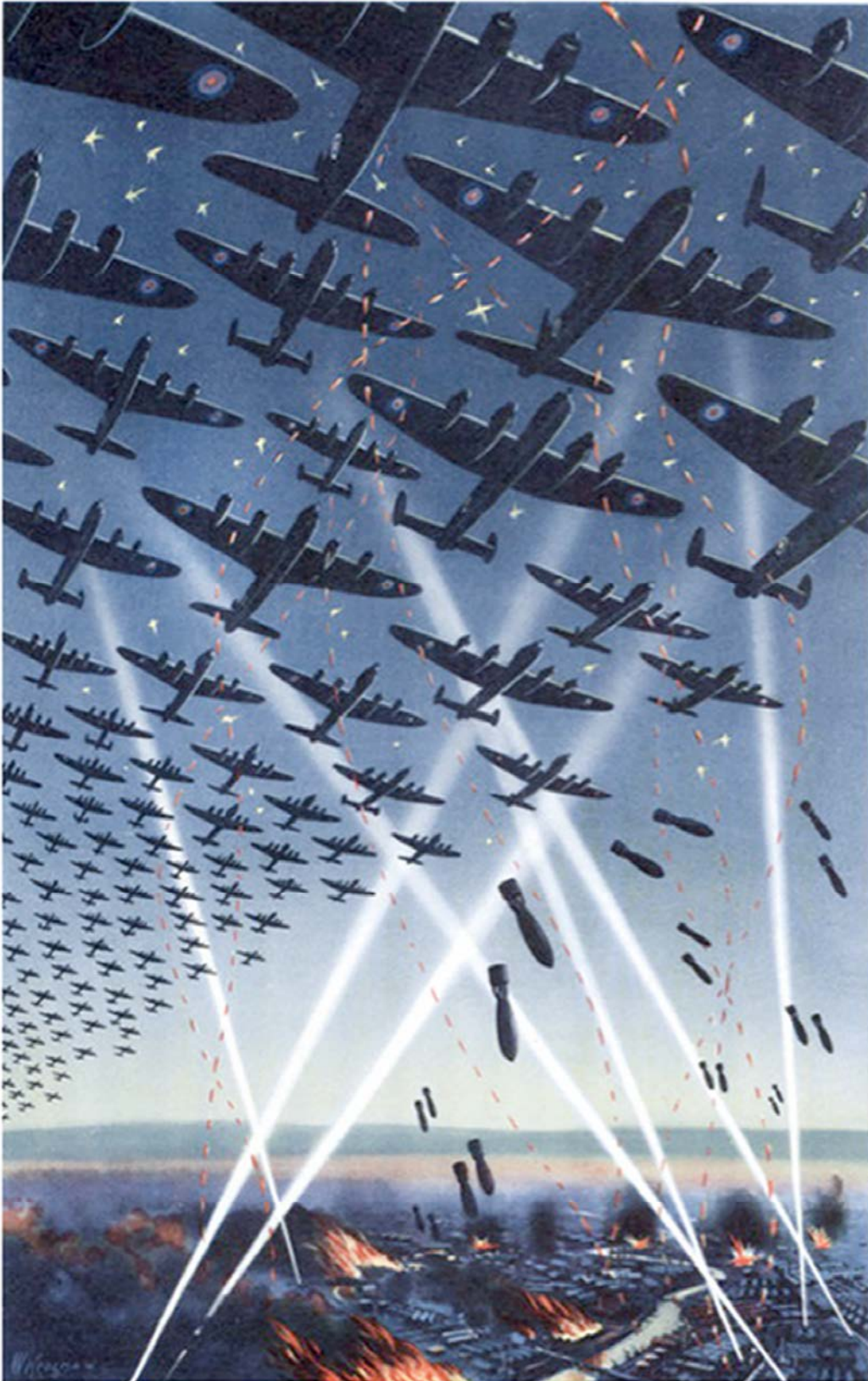
British Bombers now attack German cities a thousand at a time!